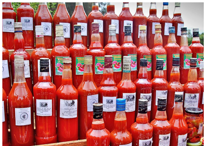
Photo credit: Wikimedia Commons /Ossewa/Piri-piri sauce in Mozambique

4. Roast at 450 degrees for about 45 minutes, until chicken is done. (Alternatively, grill on medium with a drip pan for about 40 minutes). Pour warm glaze over the chicken, carve and serve.